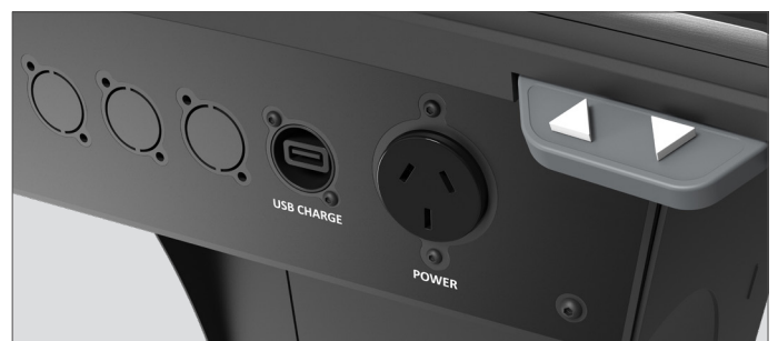
Height adjustment control buttons and input panel with space for optional additional inputs.